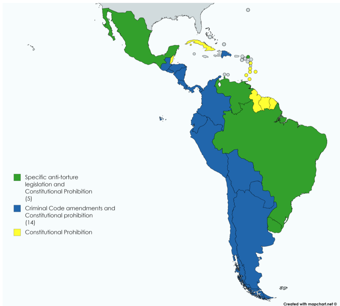
Figure 1. Overview of the national approaches regarding the prohibition of torture